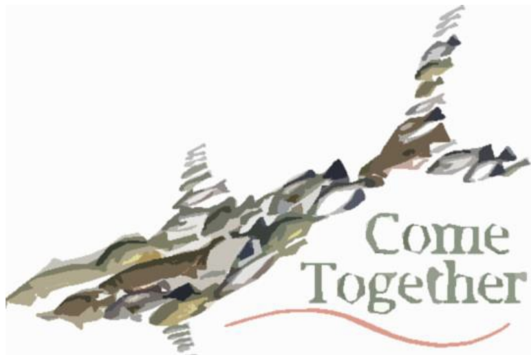
Teleconference of the National Fish Habitat Board

Meeting Book for The National Fish Habitat Board