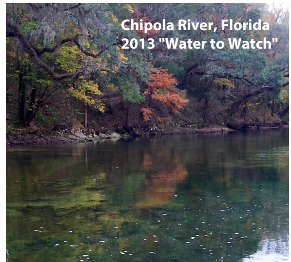
Chipola River, Florida 2013 "Water to Watch"

Meeting Book for The National Fish Habitat Board