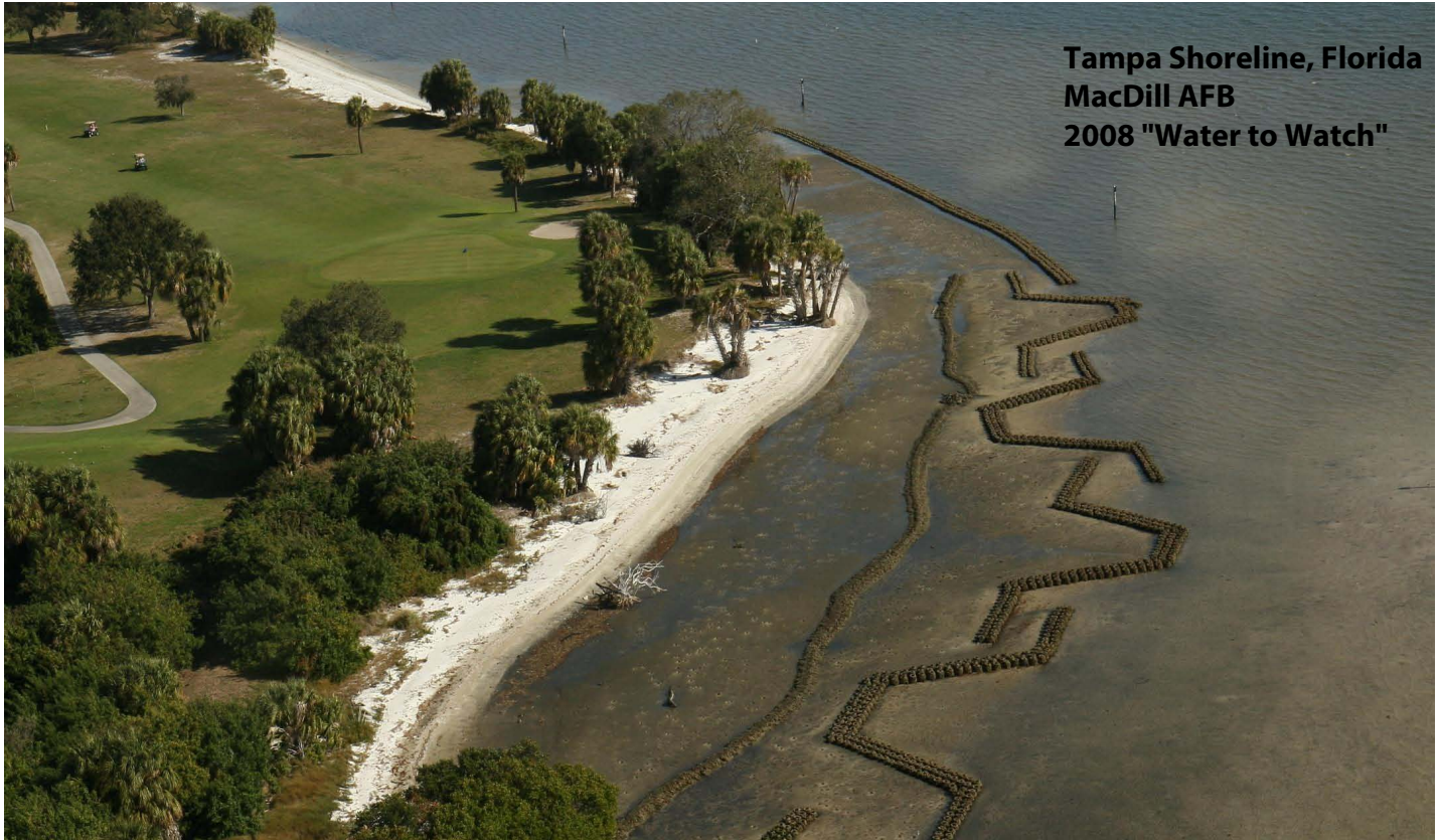
Tampa Shoreline, Florida MacDill AFB 2008 "Water to Watch"