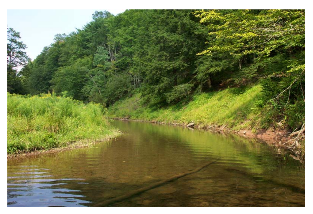
Riparian target area in the Cross Fork subwatershed.