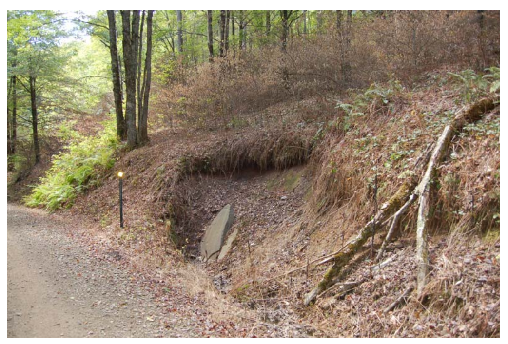
Improper drainage from unimproved dirt and gravel road adjacent to Class A native brook trout stream.