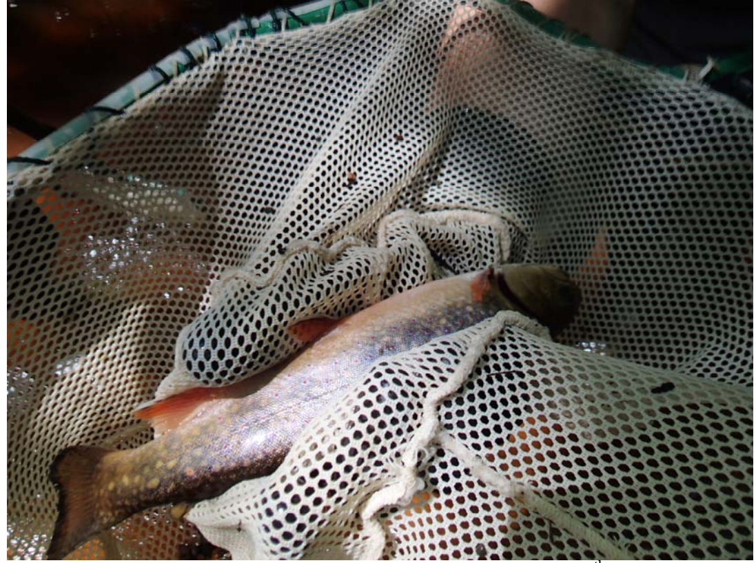
Brook trout, Billy Brown Brook, July 2013, below installation at 4<sup>th</sup> Lake Rd