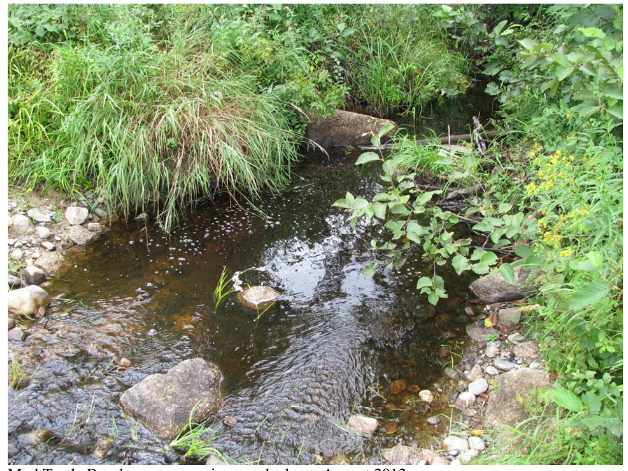
Mud Turtle Brook, upper crossing, washed out, August 2012 Post construction photos from Mud Turtle Brook will be provided in 2013.