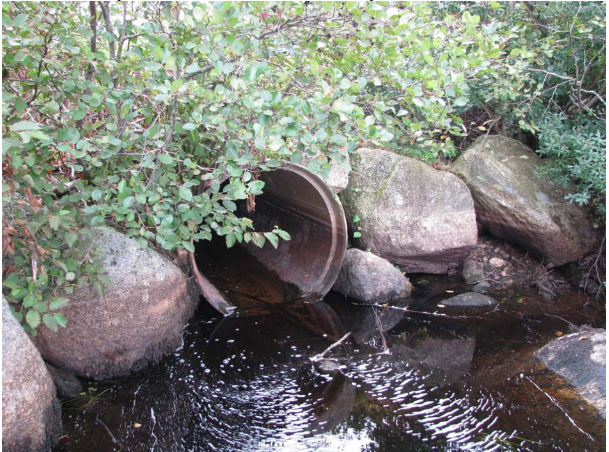
Mud Turtle Brook, lower crossing, culvert outlet, August 2012