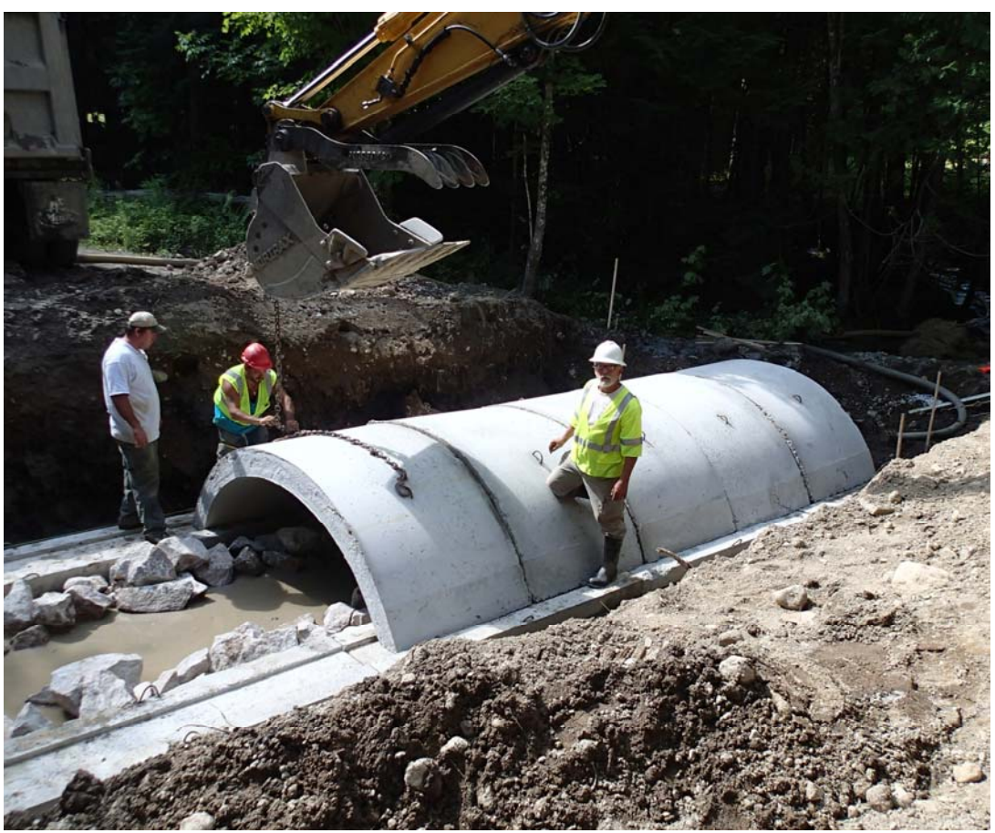
Assembling concrete arch culvert, July 30, 2013