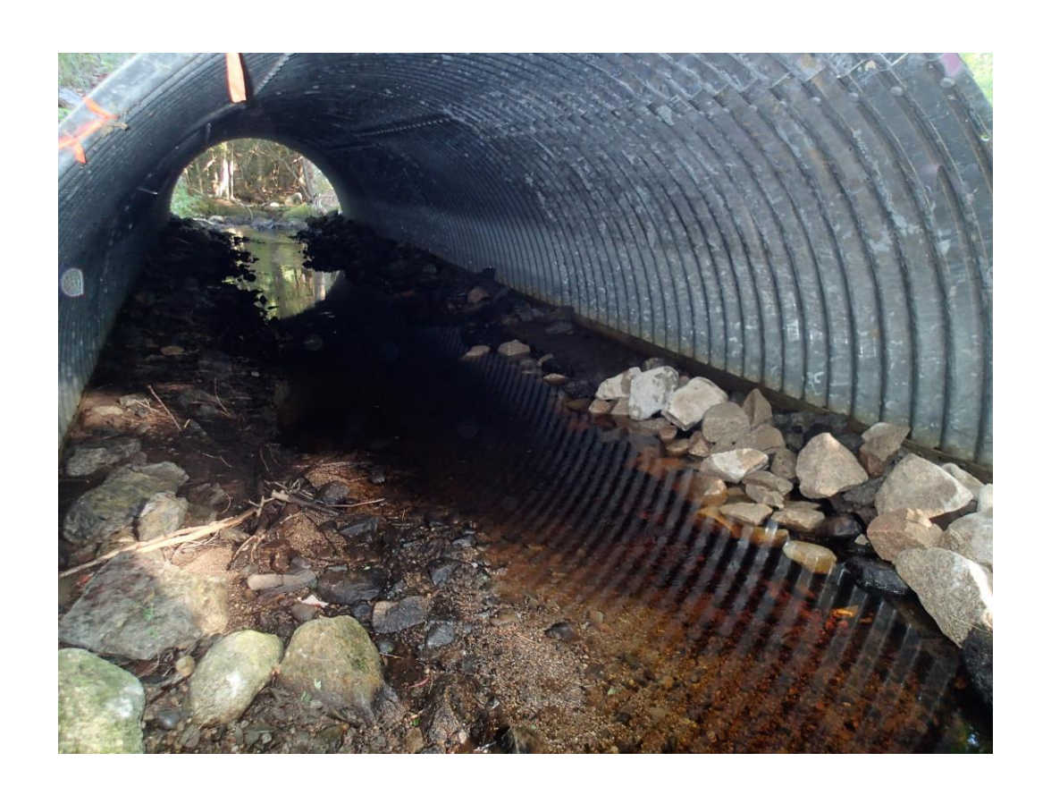
Belden Brook arch culvert (2012)