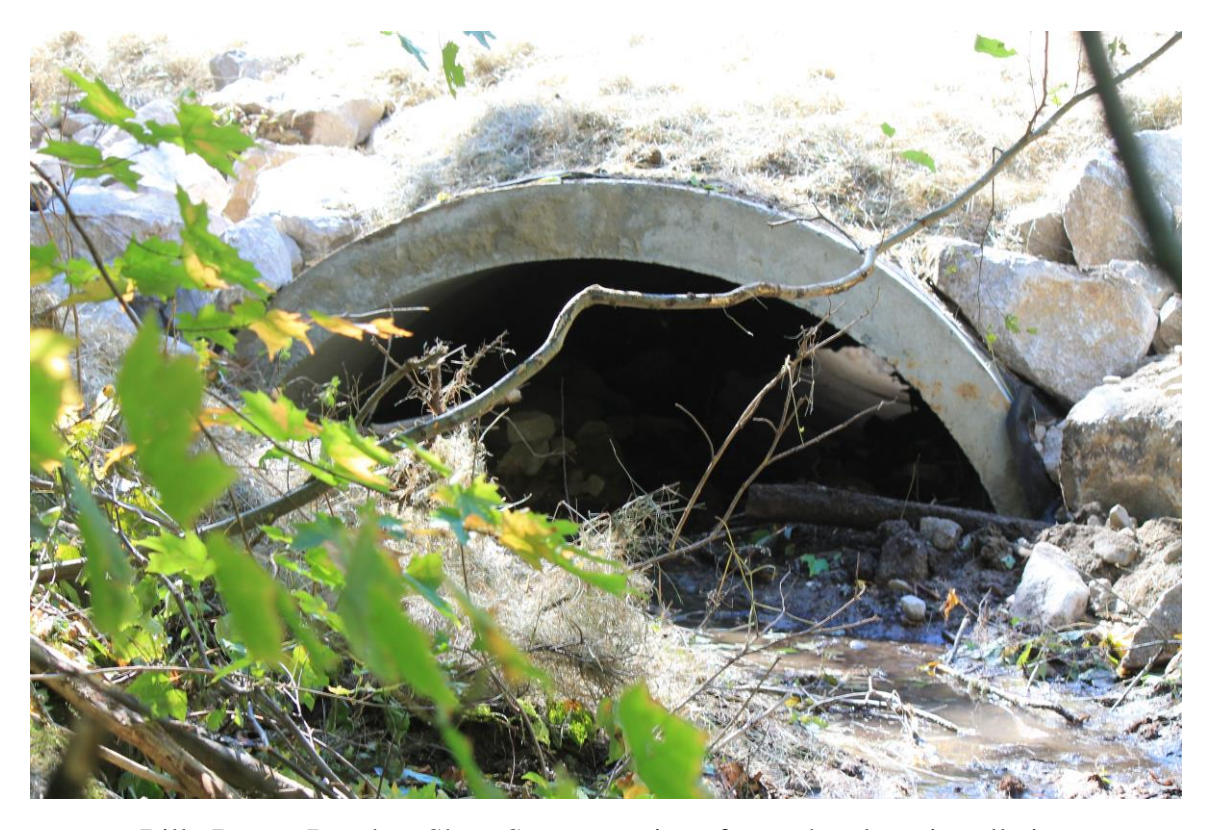
Billy Brown Brook at Shaw Street crossing after arch culvert installation in 2014.