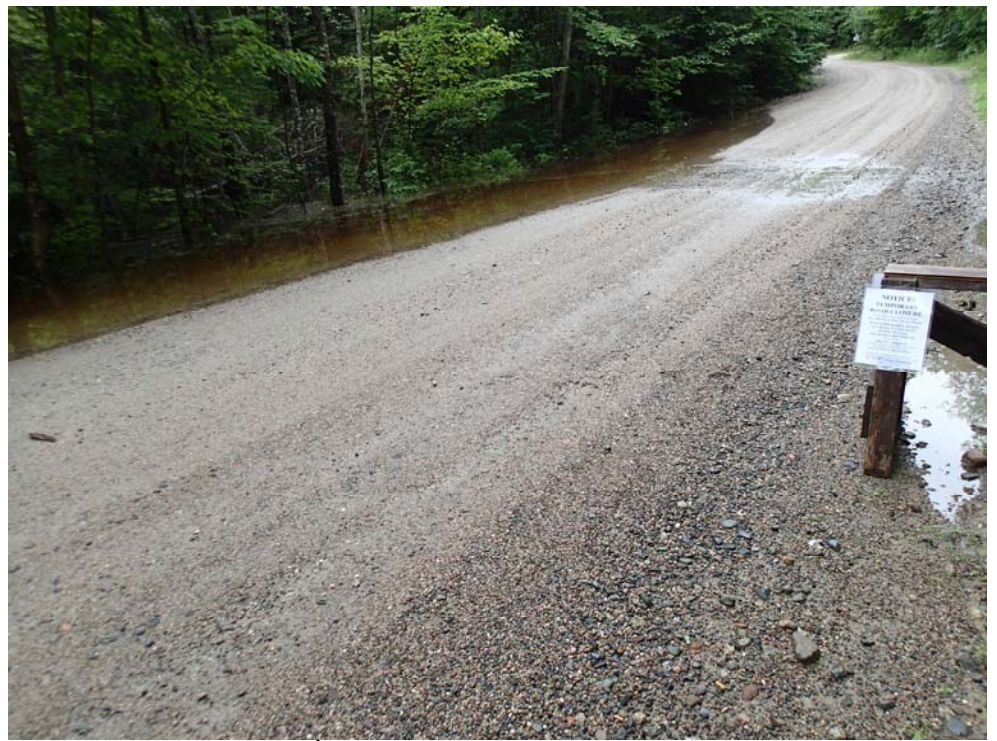
Billy Brown Brook at 4th Lake Rd, flooded, July 2013

Location: Washington County, Maine Sponsor: Downeast Lakes Land Trust Annual Report Date: December 16, 2013