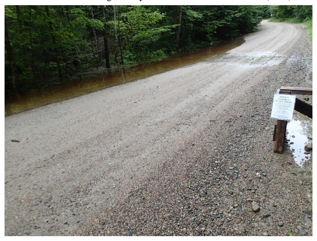
4<sup>th</sup> Lake Road crossing of Billy Brown Brook before and after (2013).