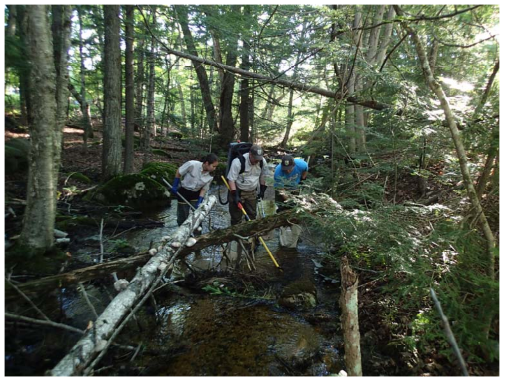
USFWS personnel electrofishing Billy Brown Brook prior to construction 2013