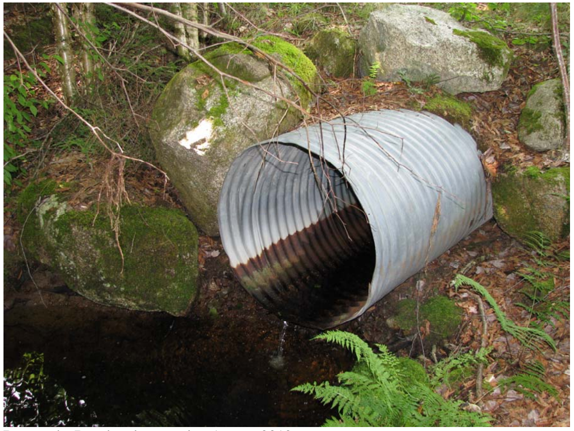
Burroughs Brook culvert outlet, August 2012