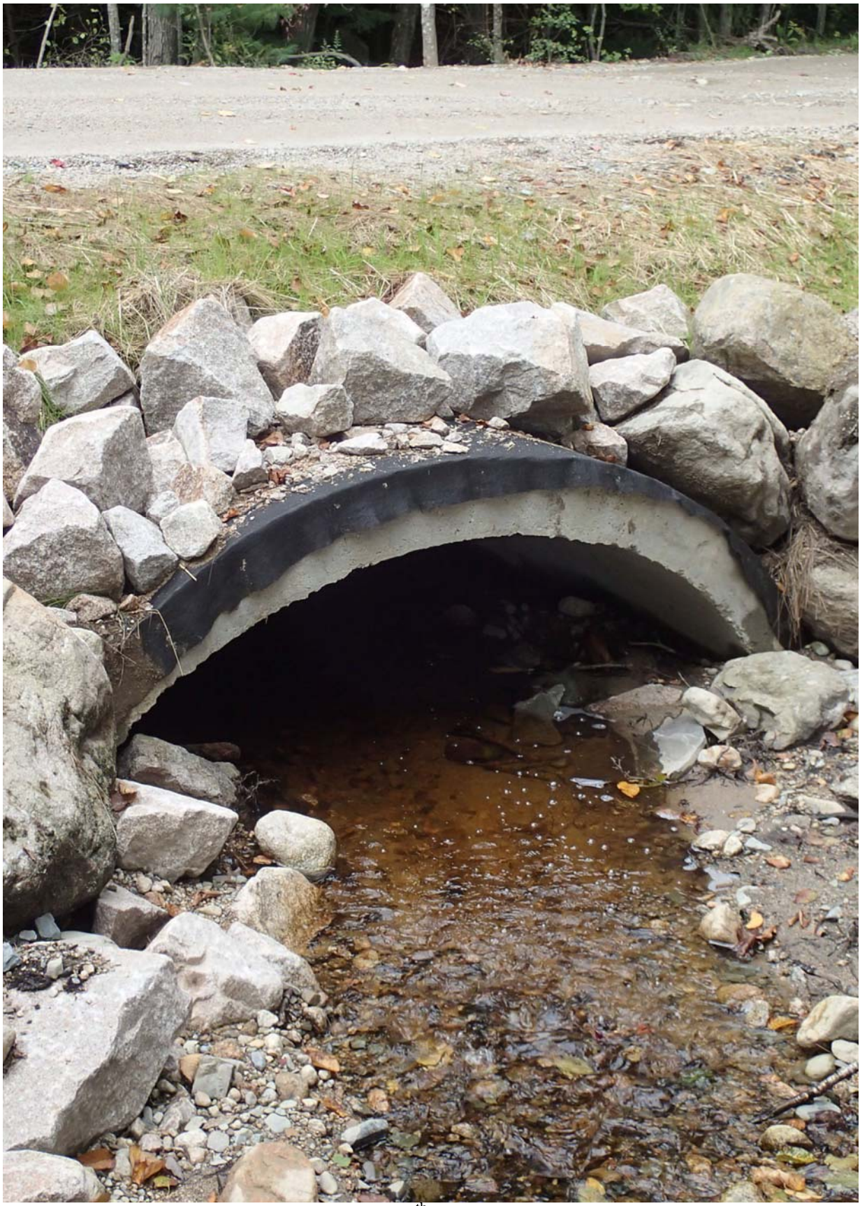
Inlet of concrete arch, Billy Brown Brook at 4<sup>th</sup> Lake Rd, Sept. 15, 2013