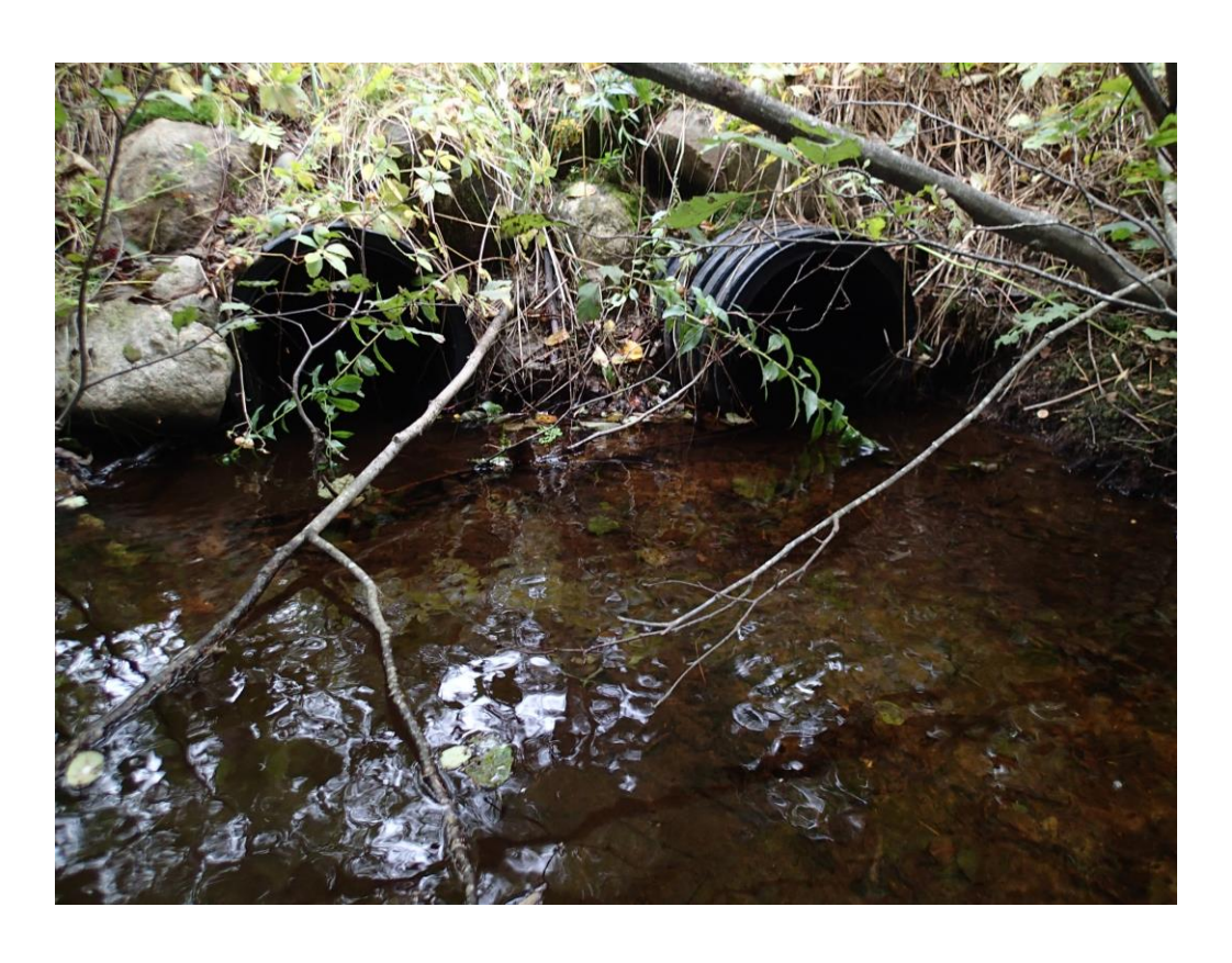
Billy Brown Brook at Shaw Street crossing prior to arch culvert installation in 2014.