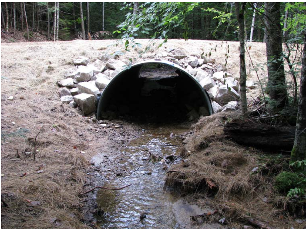
4<sup>th</sup> Machias tributary arch culvert outlet, Sept. 2012, immediately post construction