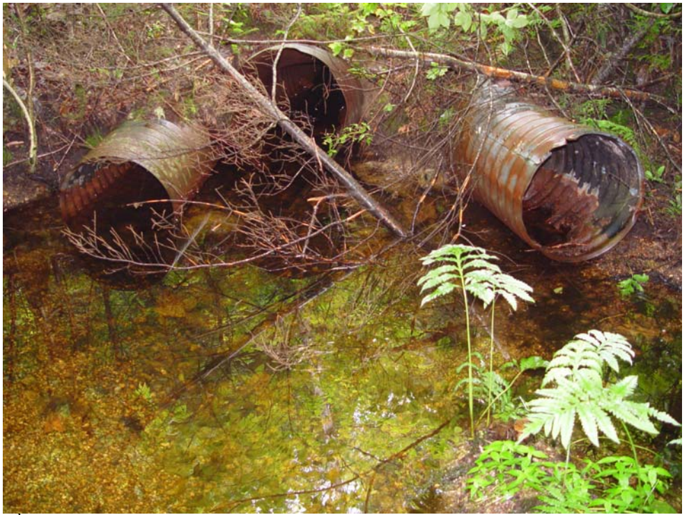
4<sup>th</sup> Machias tributary culvert outlets, July 2006

Location: Washington County, Maine Sponsor: Downeast Lakes Land Trust Annual Report Date: December 19, 2012