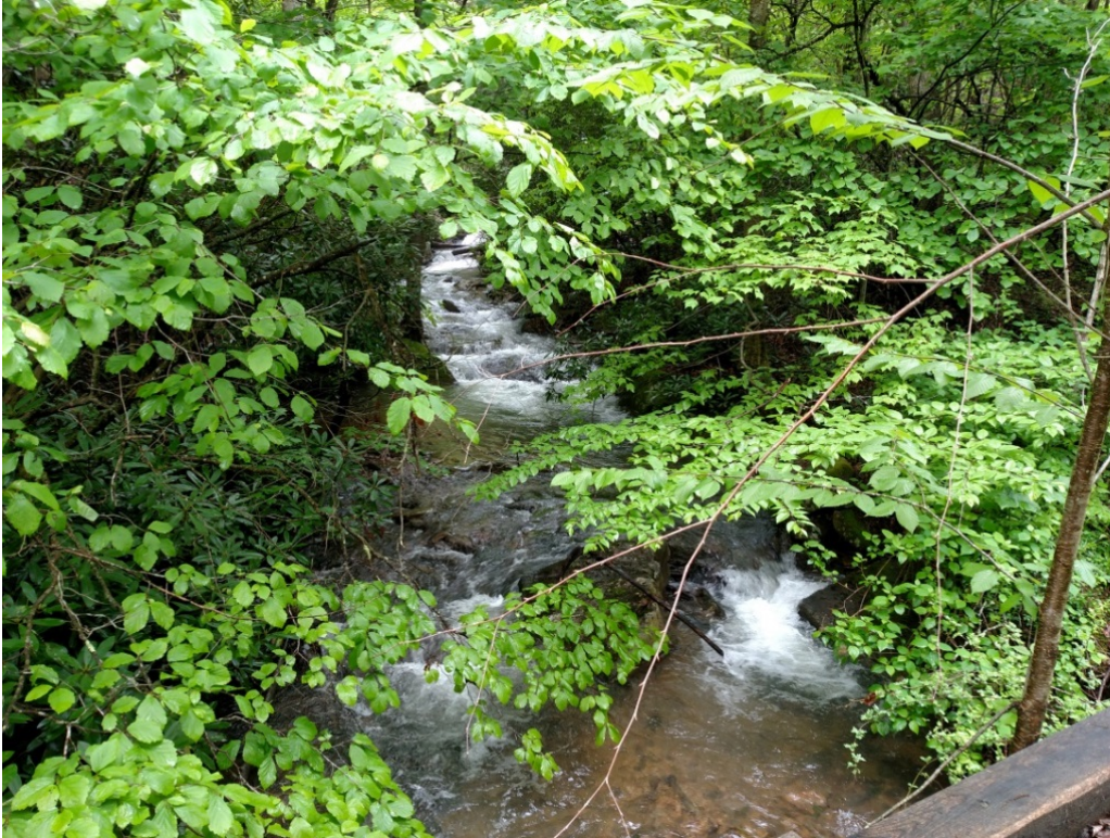
Up Stream of 3 culverts with wooden bridge deck on top of the culverts