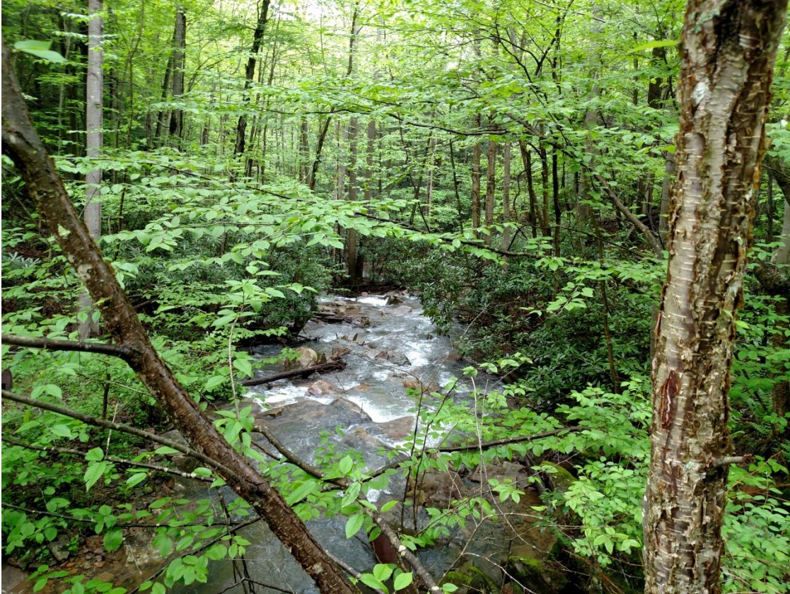
Another view looking further downstream from the crossing

We did not have a good photo showing the 3 failed culverts with the bridge deck on top.