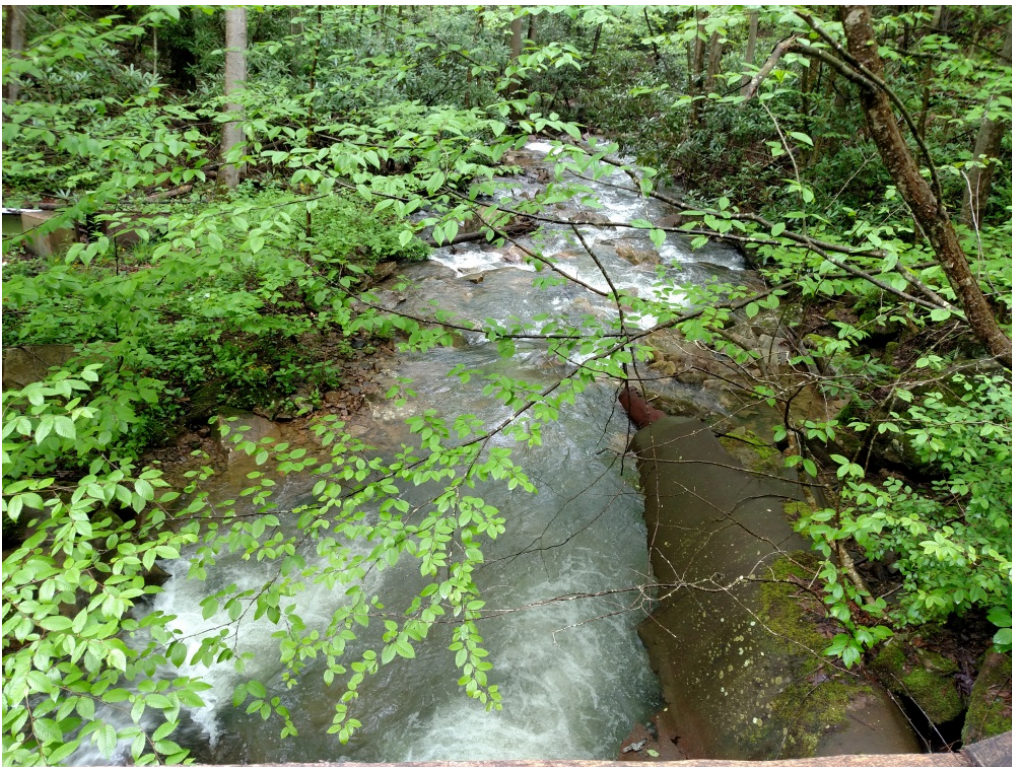
Downstream of the 3 culverts, one of the culverts is visible beyond the bridge deck.