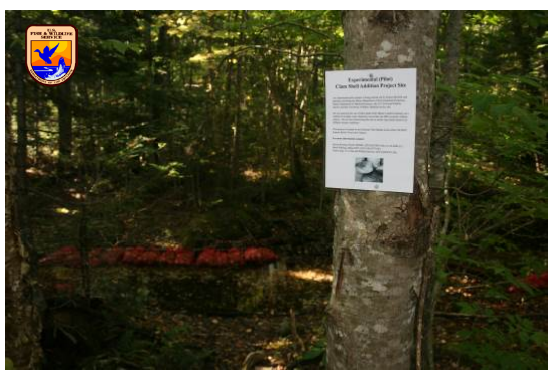
Page 5 of 5