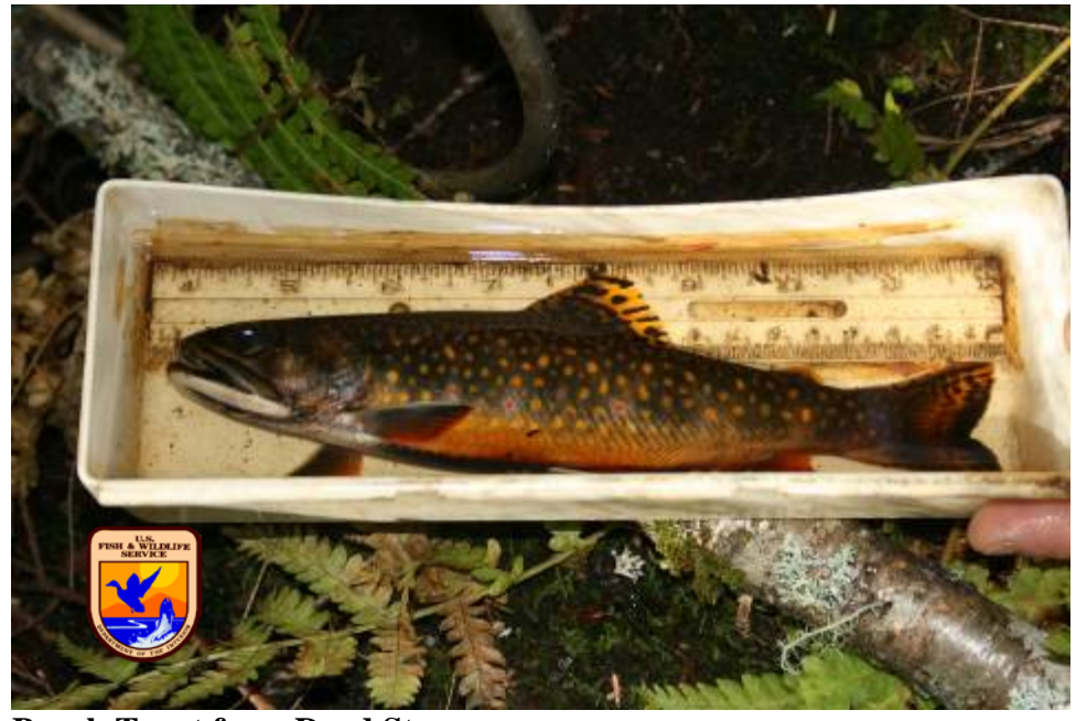
Brook Trout from Dead Stream